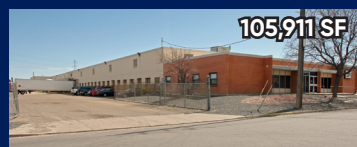
4300 Oneida St, Denver Represented Seller