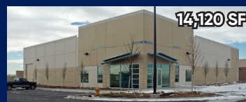
19401 E 23rd Ave, Aurora Represented Seller