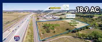
1004 S I-25 Svc Rd, Castle Rock Represented Buyer