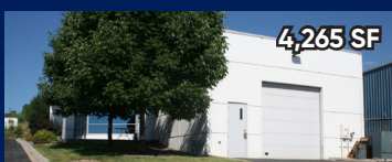
12290 W Alameda Dr, Lakewood Represented Buyer