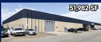
575 Osage St, Denver Represented Buyer