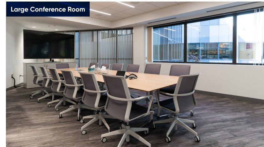
Large Conference Room