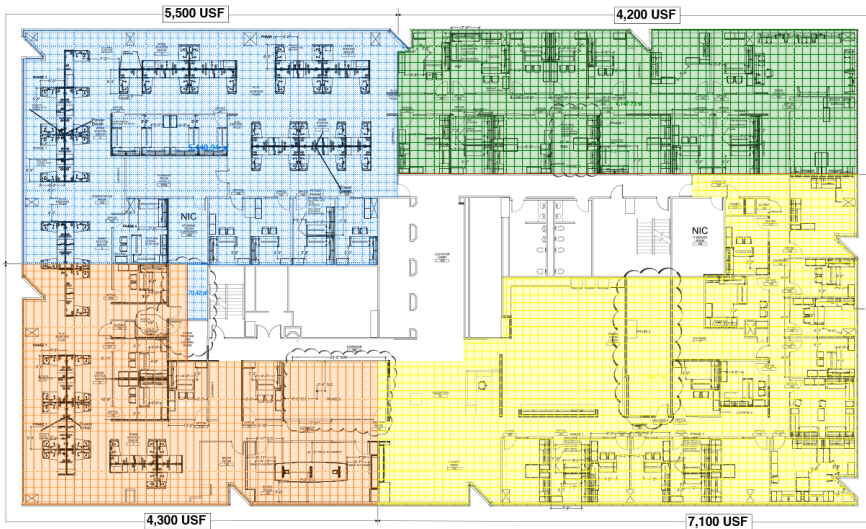
6th Floor – Suite 600