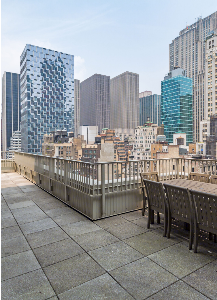
Private Outdoor Terrace