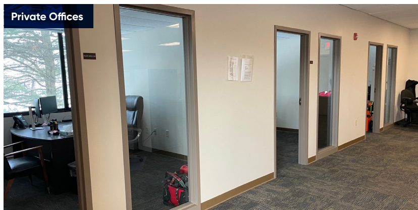
Even though obtained from sources deemed reliable, no warranty or representation, express or implied, is made as to the accuracy of the information herein, and it is subject to errors, omissions, change of price, rental or other conditions, withdrawal without notice, and to any special listing conditions imposed by our principals.