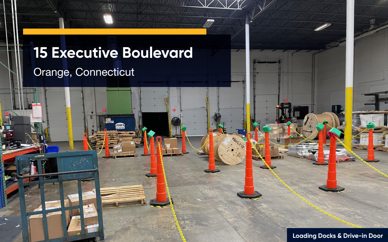
Loading Docks & Drive-in Door