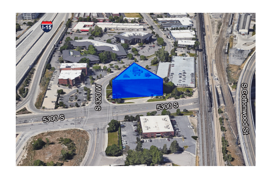
FOR MORE INFORMATION