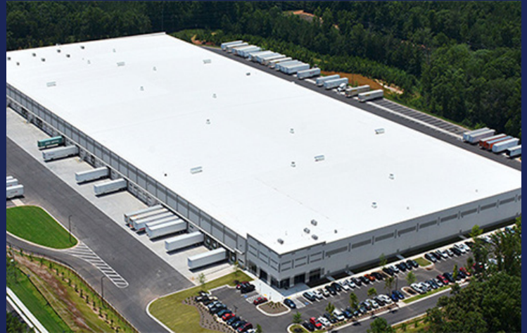
1595 Heraeus Blvd