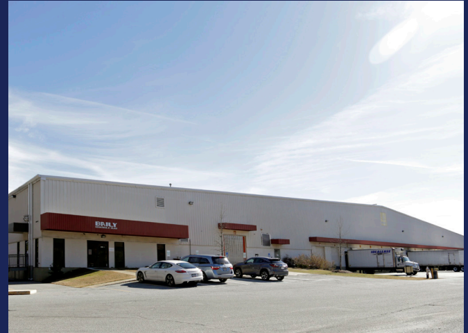
3312 N Berkeley Lake Rd. | 80,000 SF

Consolidating a Company Under One Roof & Subleasing Additional Space